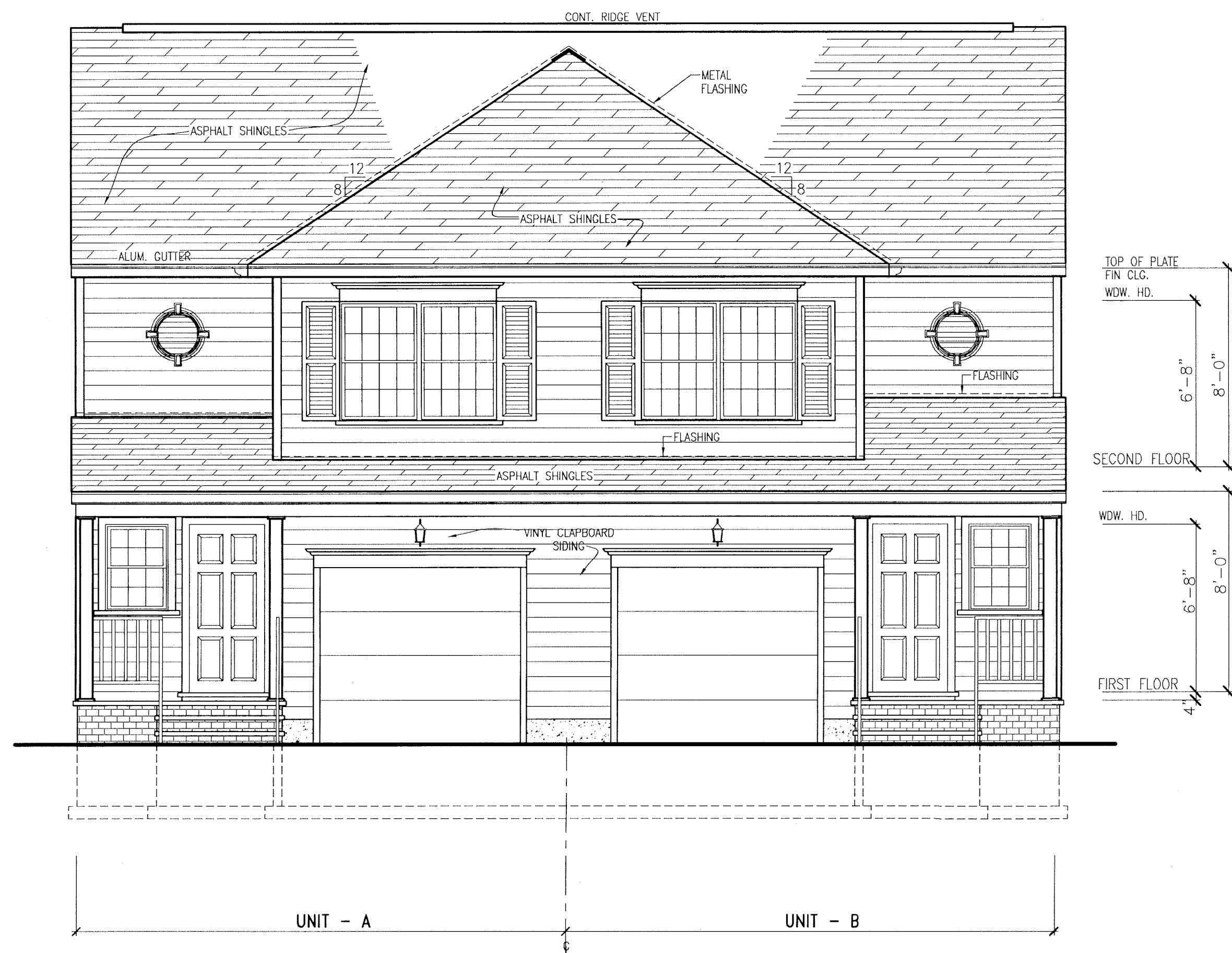
FRONT ELEVATION "C" SCALE: 1/4" = 1'-0"