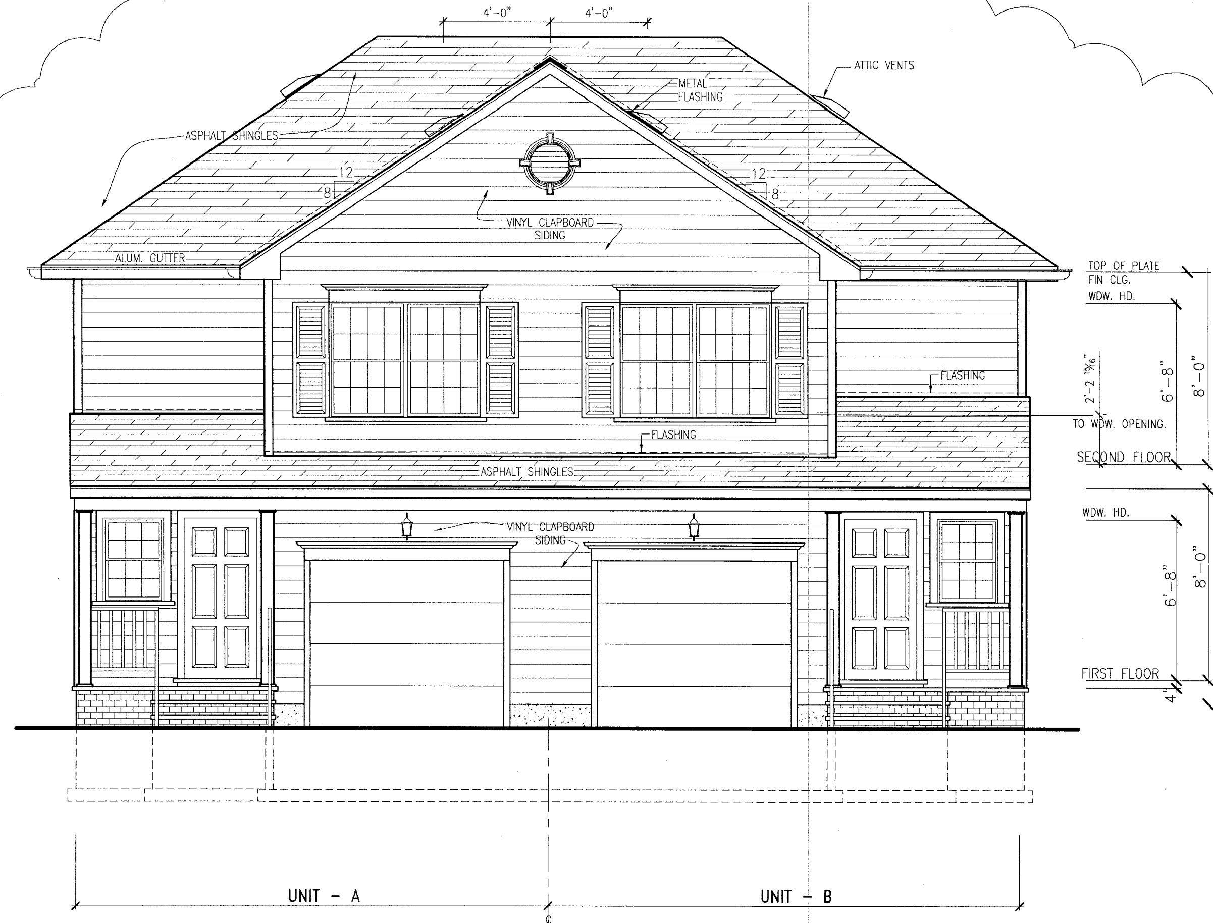
FRONT ELEVATION "B" SCALE: 1/4" = 1'-0"