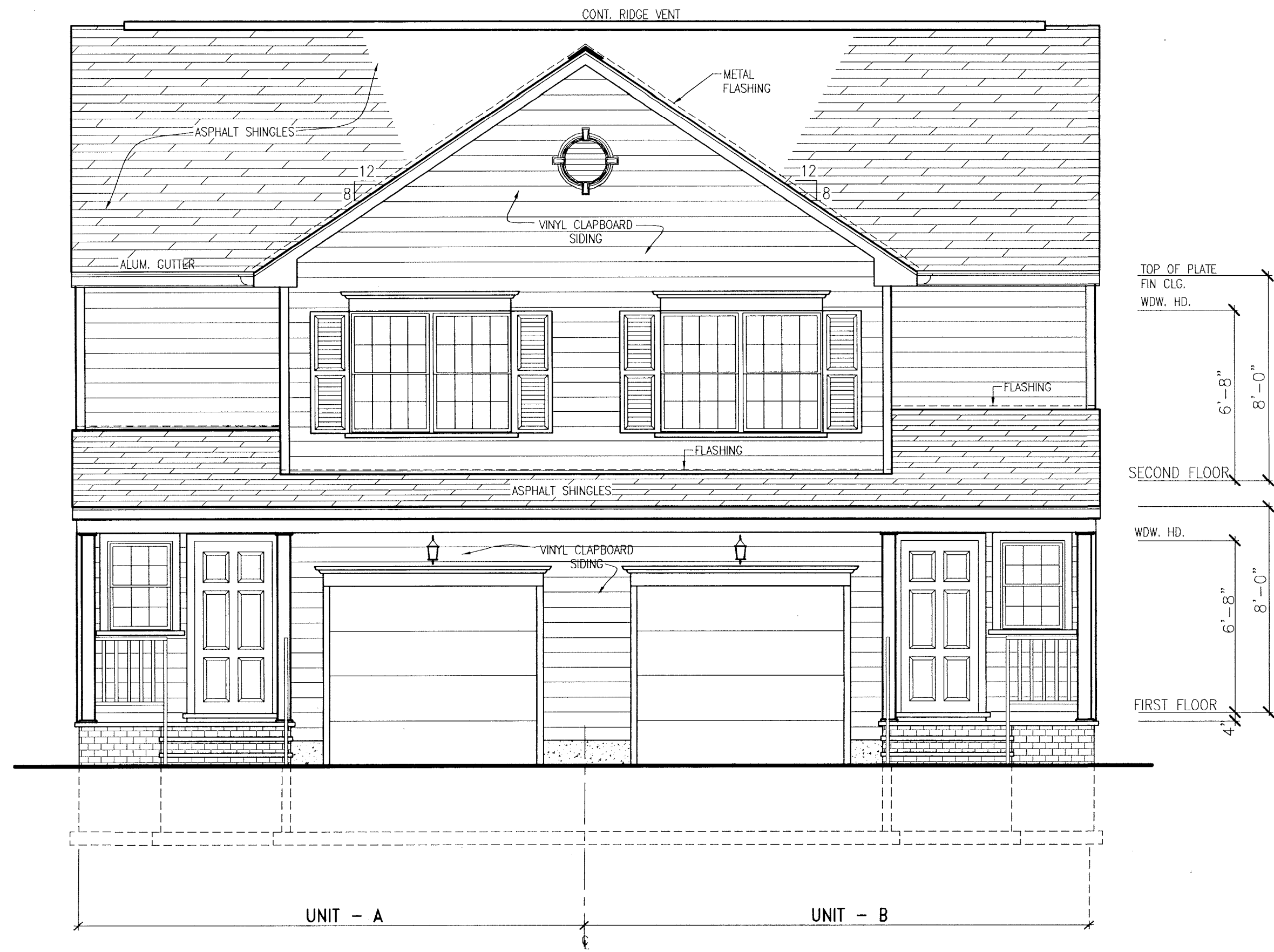
FRONT ELEVATION "A" SCALE: 1/4" = 1'-0"